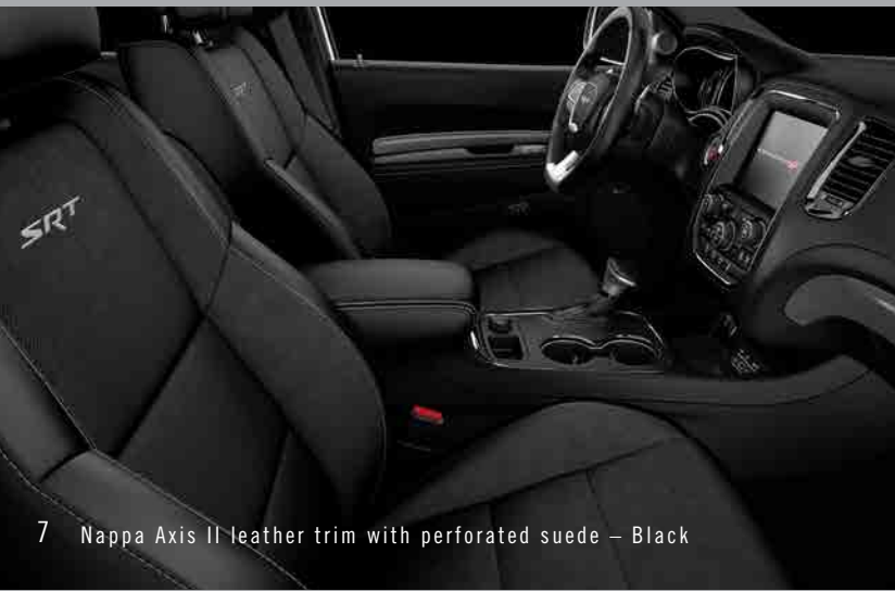
7 Nappa Axis II leather trim with perforated suede – Black