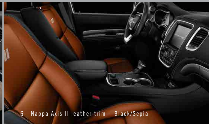
6 Nappa Axis II leather trim – Black/Sepia