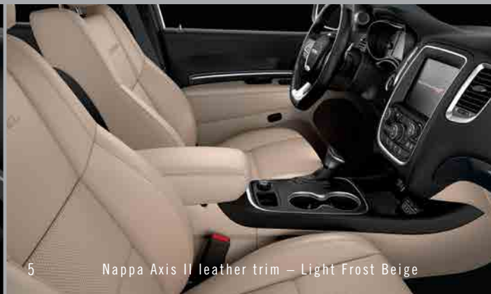
5 Nappa Axis II leather trim – Light Frost Beige