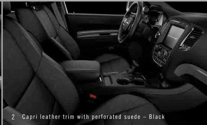
2 Capri leather trim with perforated suede – Black