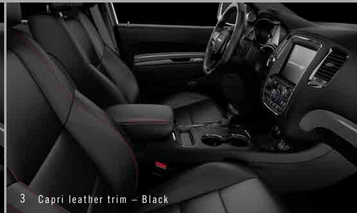
3 Capri leather trim – Black