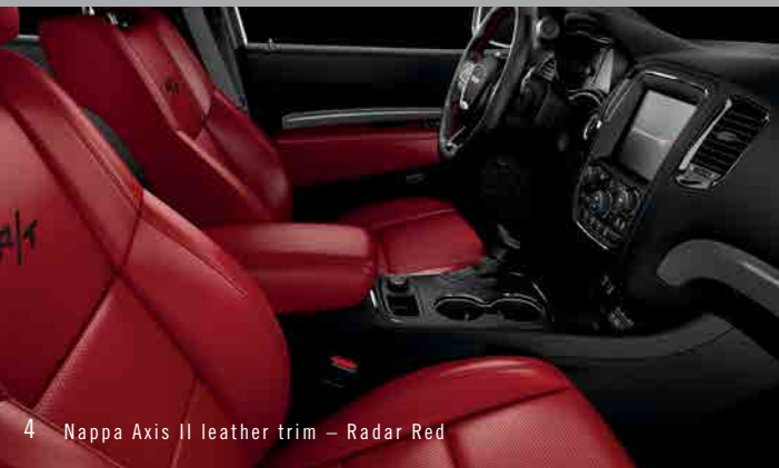
4 Nappa Axis II leather trim – Radar Red