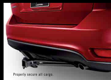
Properly secure all cargo.